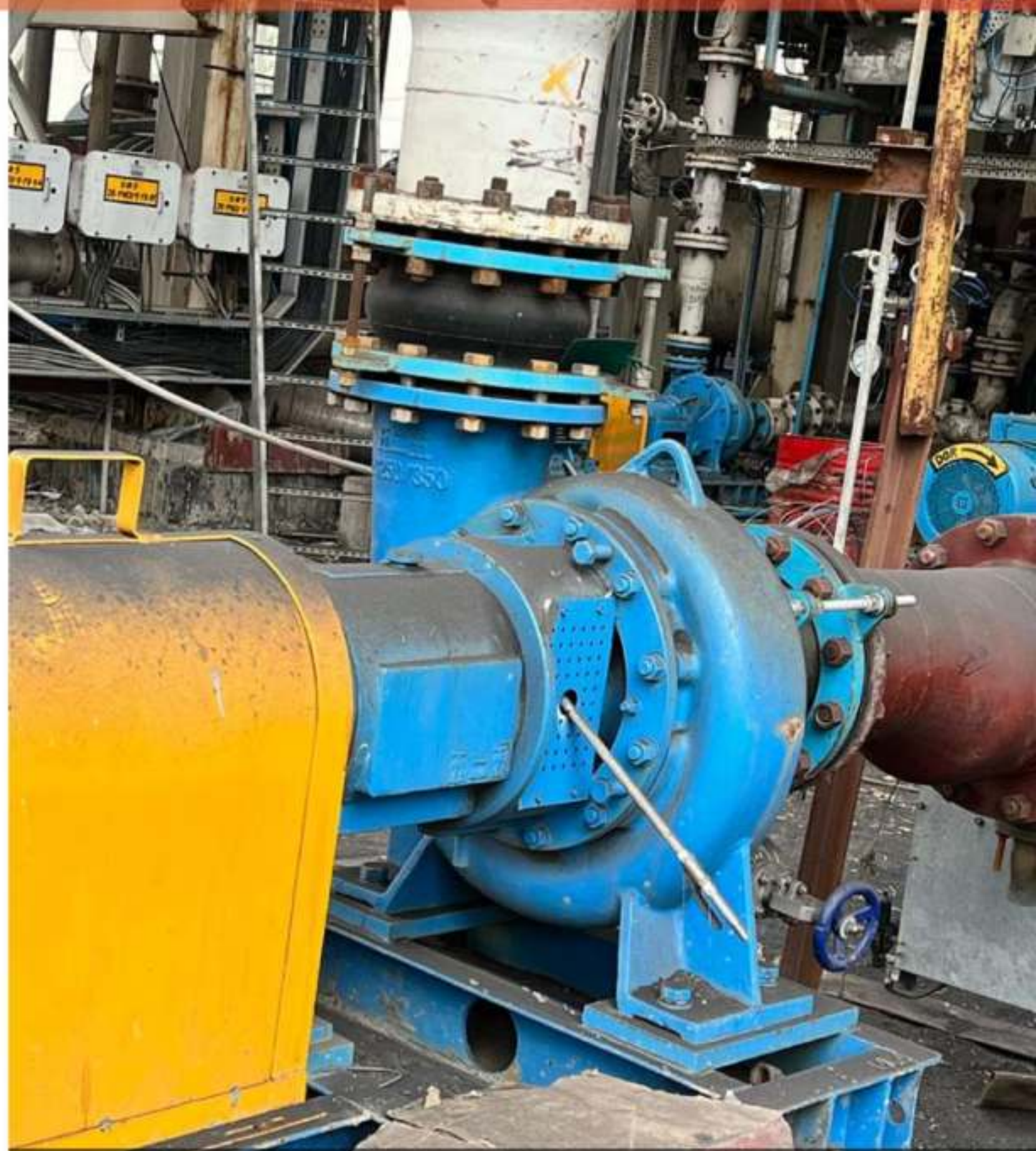
Rubber Expansion Joints fitted with Centrifugal Pumps for pumping Slurry to Spray Nozzles