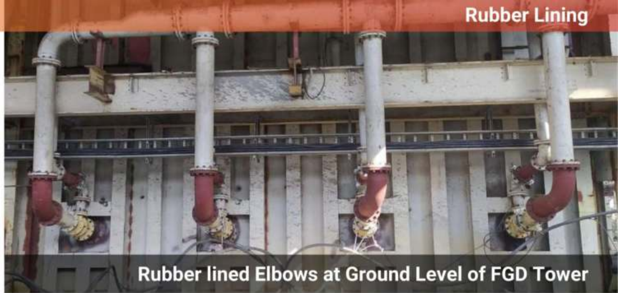
Rubber lined Elbows at Ground Level of FGD Tower