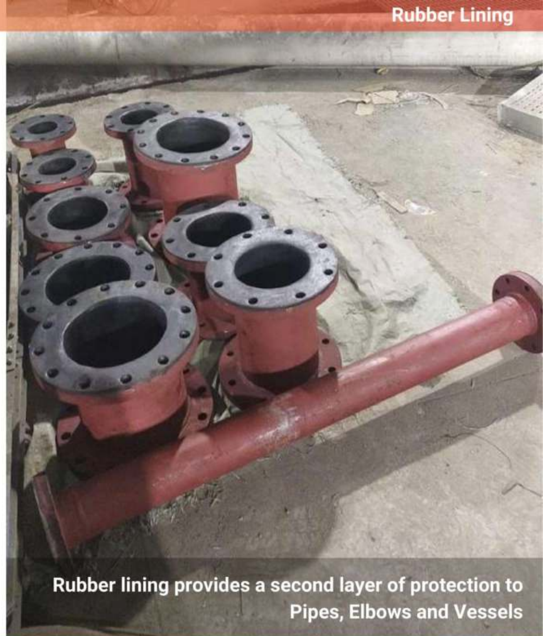
Rubber lining provides a second layer of protection to Pipes, Elbows and Vessels