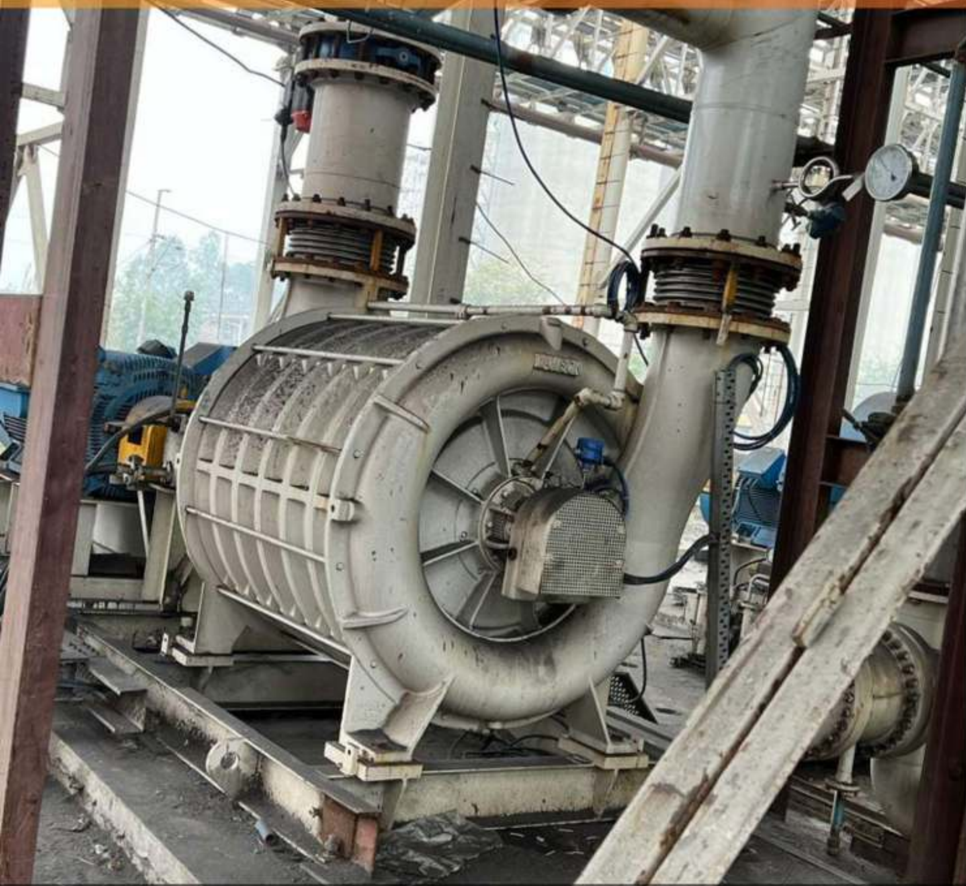
Metallic Expansion Joints fitted with Oxidation Air Blower for the Gypsum separation process at FGD Plant