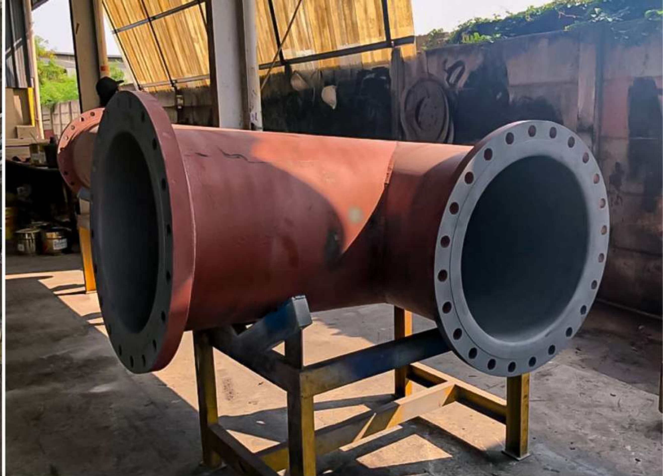
Rubber Lined Elbows