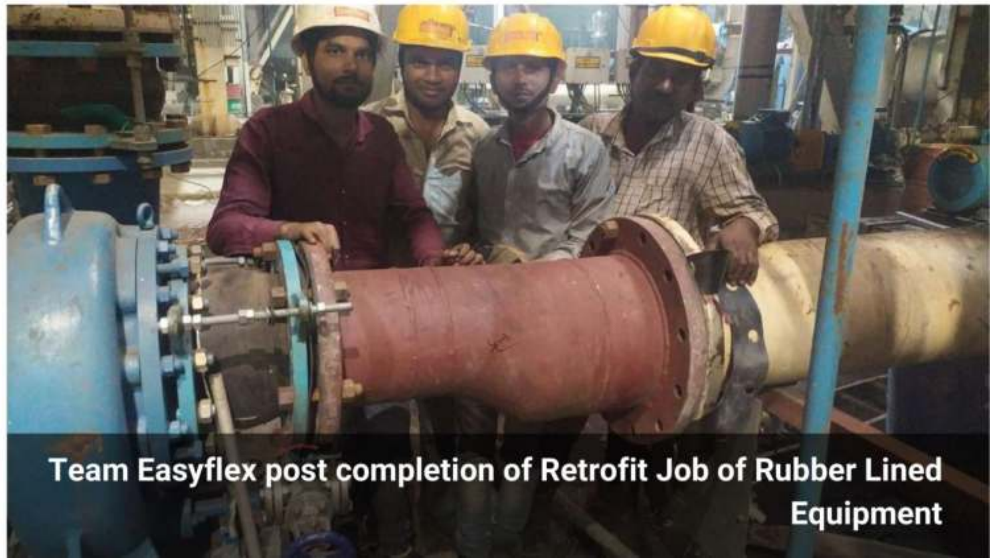
Team Easyflex post completion of Retrofit Job of Rubber Lined Equipment