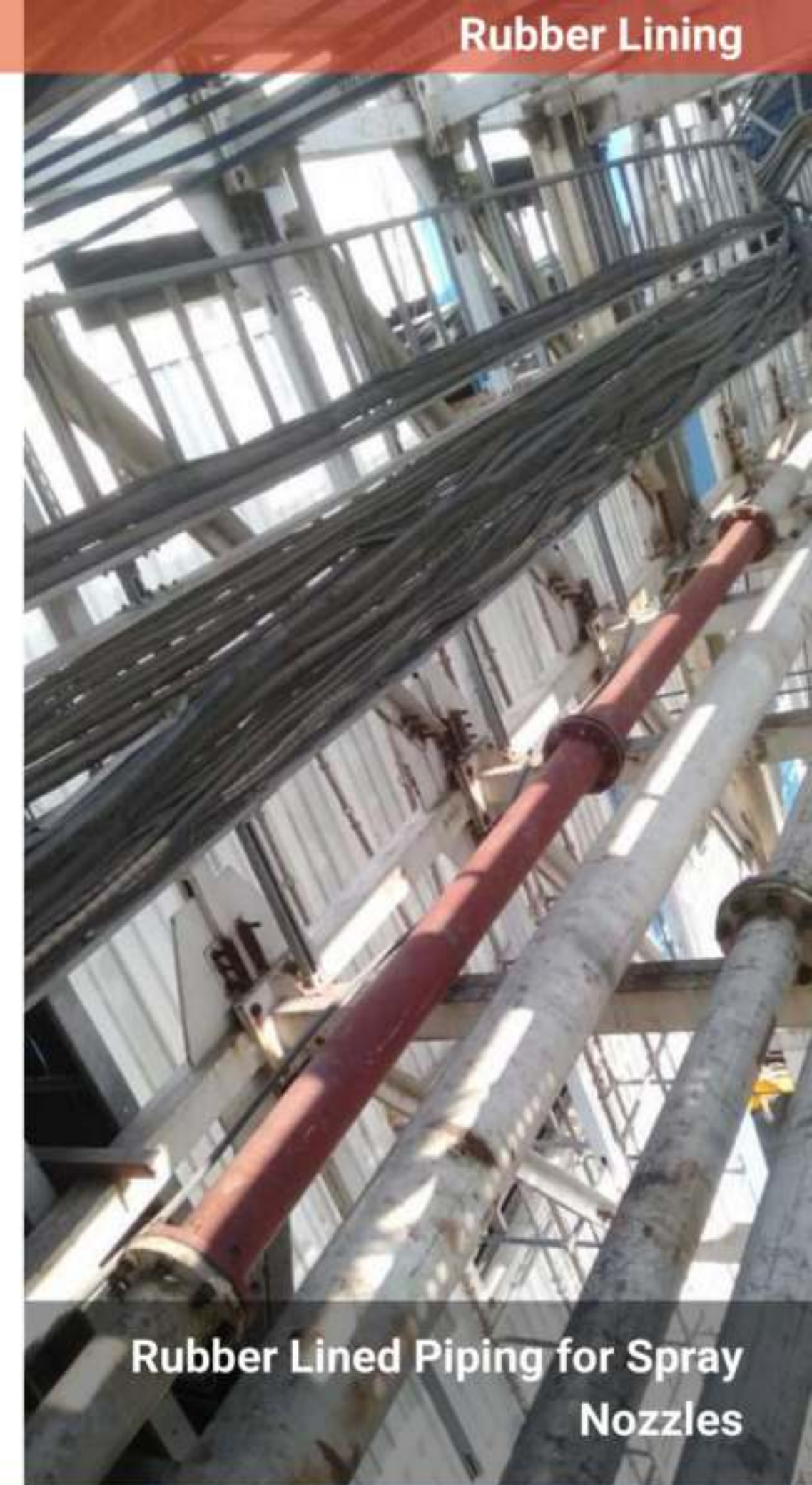
Rubber Lined Piping for Spray Nozzles