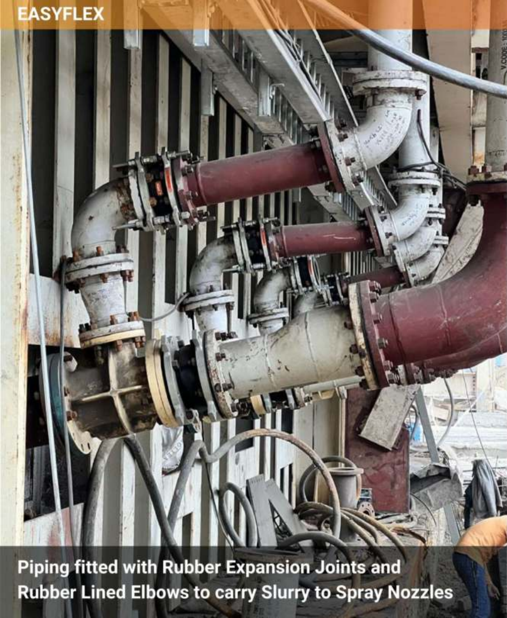
Piping fitted with Rubber Expansion Joints and Rubber Lined Elbows to carry Slurry to Spray Nozzles